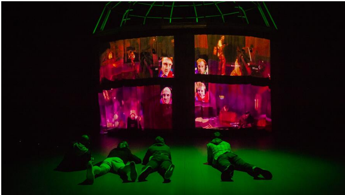
All's Well That Ends Well (RSC, 2022), directed by Blanche McIntyre, and designed by Robert Innes Hopkins.

Working with the Green Book on this production fostered numerous “small sustainability wins” across all of the RSC’s production departments, which have since been implemented long term. In Running Wardrobe, this includes the use of an ozone cabinet more often than dry cleaning, thereby reducing the use of cleaning chemicals such as perchloroethylene, eliminating the fuel for the journey to and from the dry cleaners, and reducing the amount of plastic used by costumes returned to the theatre in polythene wrap. When it is necessary to send costumes to the dry cleaners, reusable garment bags and hangers are now provided by the RSC. While these might seem like small actions, they represent cultural and behaviour change within the department, and all add up when multiplied across the organisation.