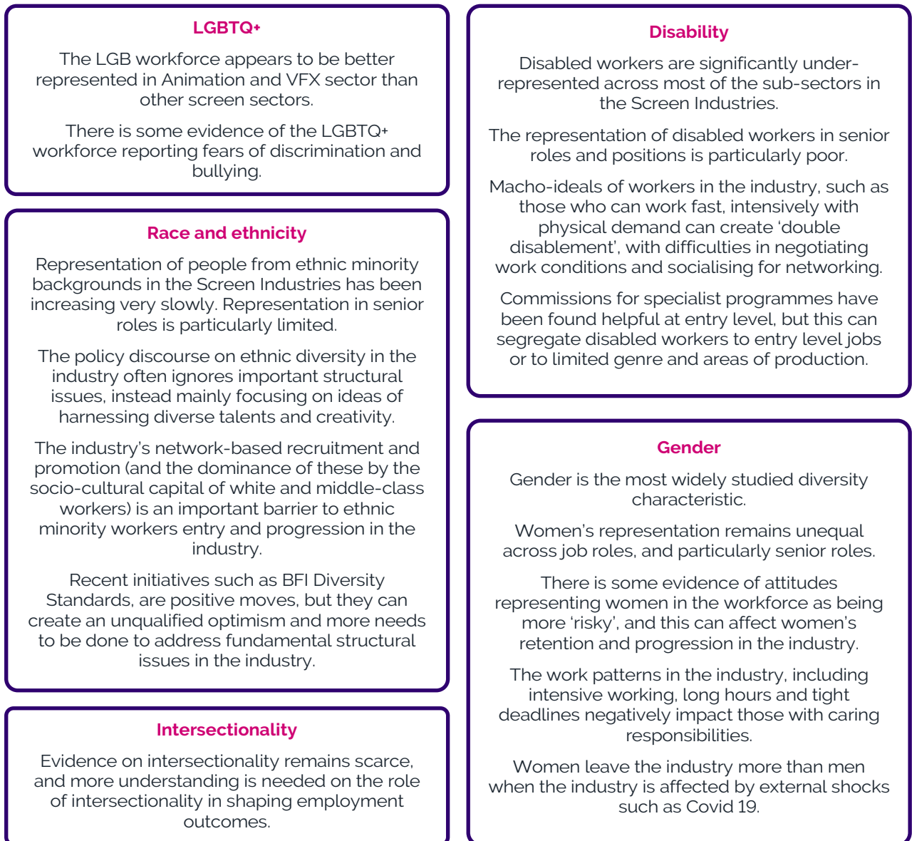
Figure 2.2 Summary of available evidence on EDI in the Screen Industries