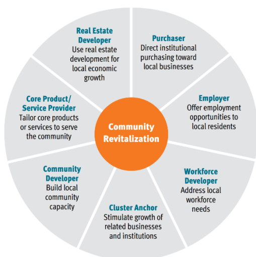
Figure 4.1: ICIC's Strategic Anchor Framework

Framework provides a useful tool for thinking about the potential range of impacts local Creative and Cultural Anchors could achieve (Figure 4.1).